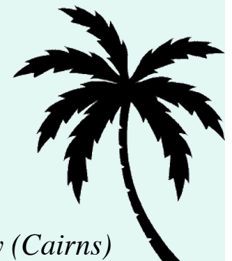
Student Equity (Cairns)