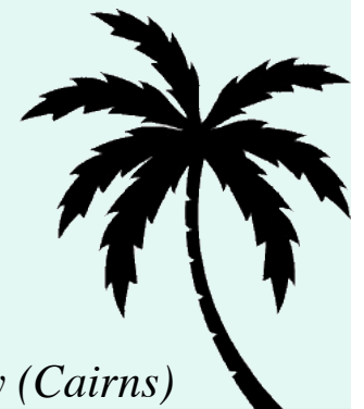
Student Equity (Cairns)