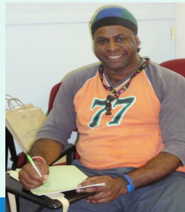
Student Equity (Cairns)