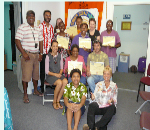
Student Equity (Cairns)